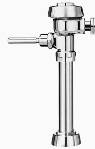
H-700-AG 1" control stop not shown